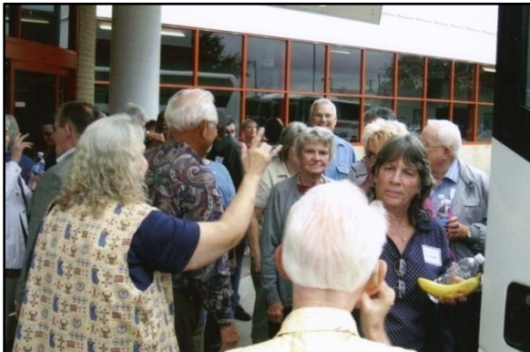
TAD-SC and La Vista members all returned home and enjoyed seeing many friends.