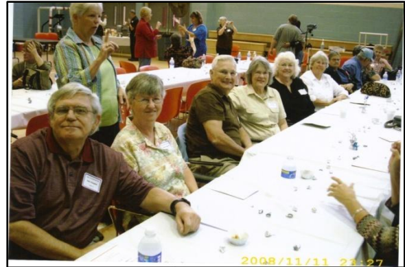
TAD-SC and La Vista members