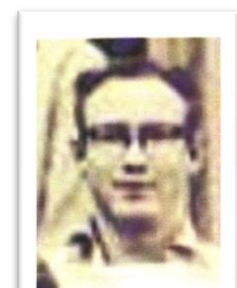
Year of 1956