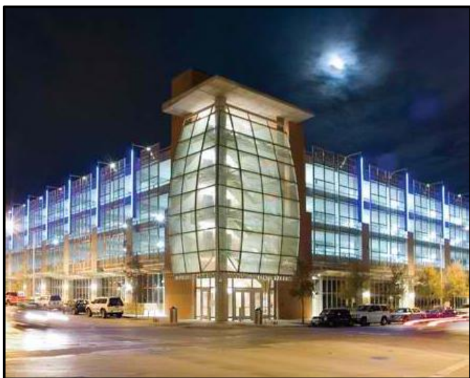
Austin Convention Center

MATA-Sign Language Media Expo 2011 at Austin, Texas October 29, 2011, Saturday, 9:00 am to 5:00 pm 500 E. Cesar Chavez St. Austin, TX 78701