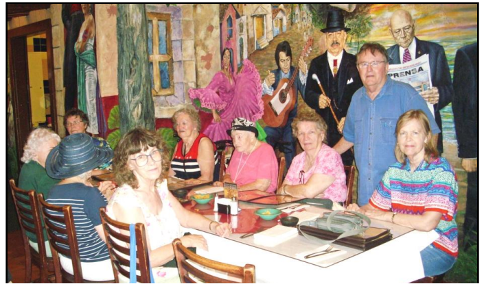
At the Market Square (El Mercado) in San Antonio, Texas Field trip to Alamo - July 14, 2011

Travis Association of the Deaf-Senior Citizens announced that they will have a field trip to Fredericksburg to visit National Museum of the Pacific War on Thursday, October 20 th . They asked La Vista Deaf Senior of San Marcos to join them on Fredericksburg Charter Bus round trip for $10.00 per person.