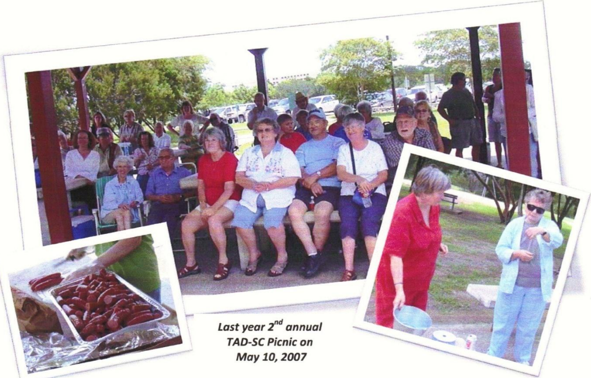
Last year 2 nd annual TAD-SC Picnic on May 10, 2007

MARY MOORE SEARIGHT METROPOLITAN PARK 907 SLAUGHTER LANE