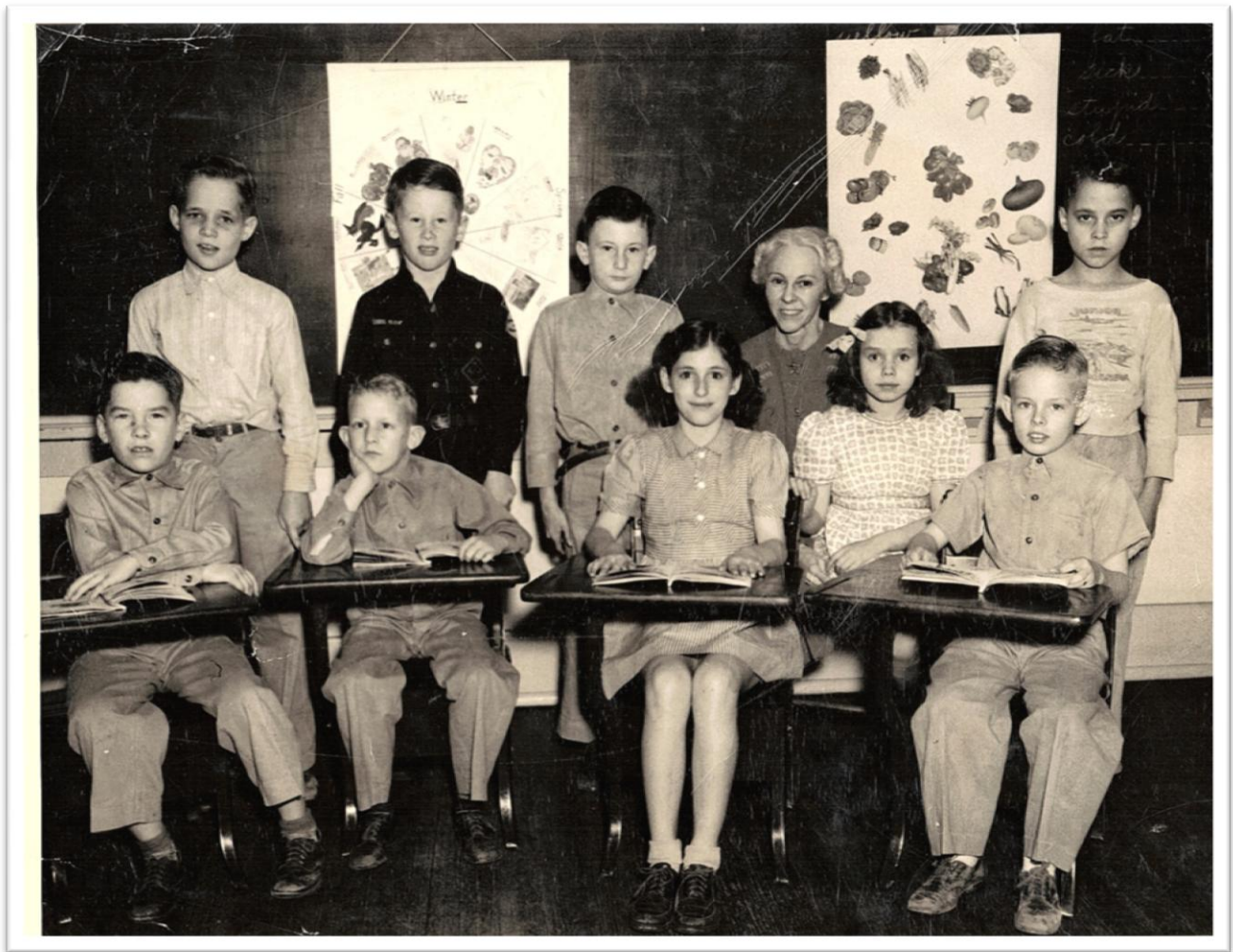
Texas School for the Deaf – Primary Hall January, 1945