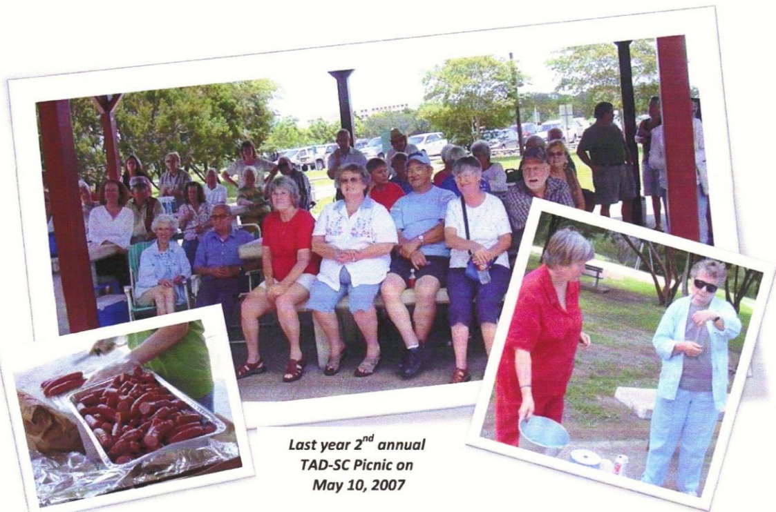
Last year 2 nd annual TAD-SC Picnic on May 10, 2007

MARY MOORE SEARIGHT METROPOLITAN PARK 907 SLAUGHTER LANE AUSTIN, TEXAS